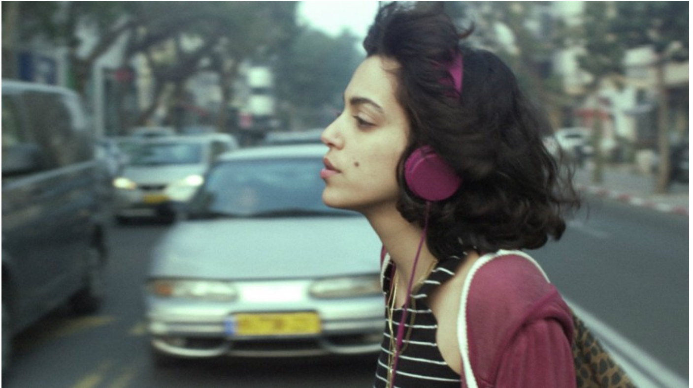
'People That Are Not Me'