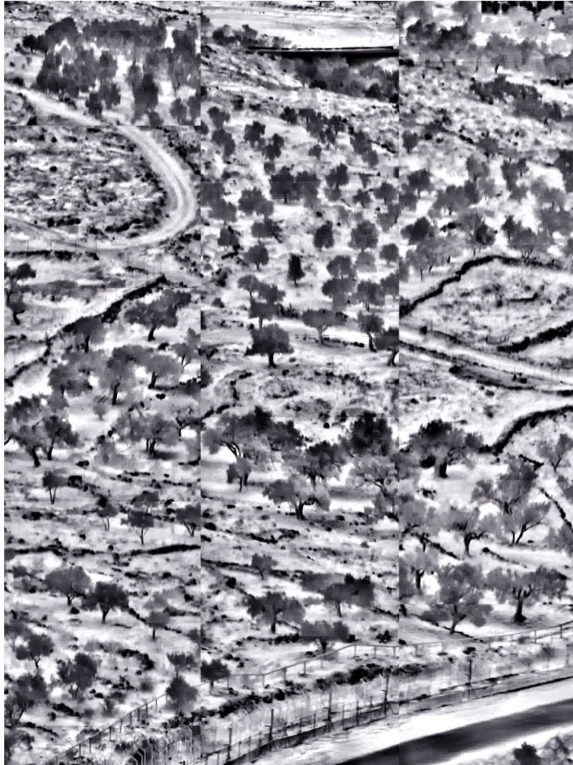
Netta Laufer, from video "25 FT – West Bank" (2016). Credit: Netta Laufer

Israel cyberattack | Israel Election 2019 | Trump - Syria | Poland - Holocaust | Livni | Putin - Israel