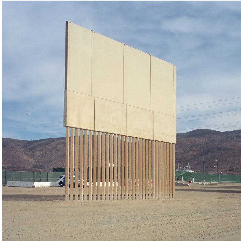
Assaf Evron, "Untitled (San Diego, Prototype of a Wall)" (2018).

90 days later. But beyond the somewhat familiar insight that defense lines exist within our psyche, just as they do in the very real Great Wall, there's not much to it.